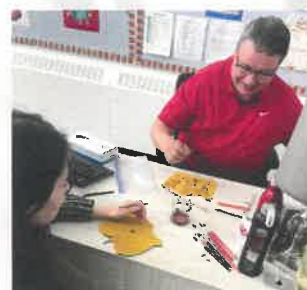
Spotted! Napi Comics @ Fleetwood