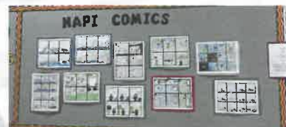
Think Outside @ Fleetwood