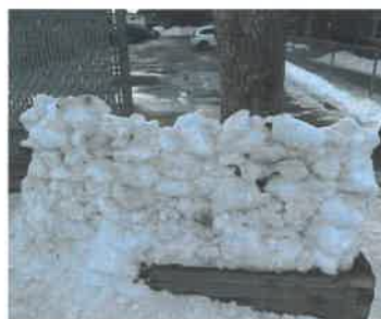
Agnes Davidson students built an igloo!