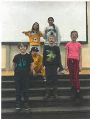
General Stewart Orange Shirt Day collaboration