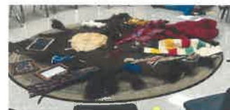
Carnival @ Agnes Davidson