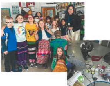
Ribbon skirt/dress making at Senator Buchanan