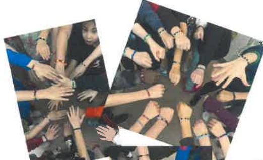
Wolf Willow bracelets @ Probe