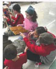
Buffalo Kit @ Plaxton