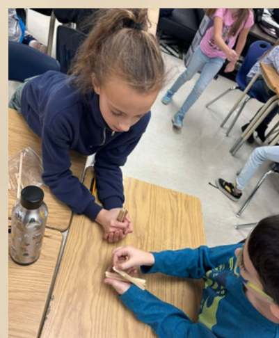
Grade 3's learn about Indigenous games, art, and make their own land acknowledgement