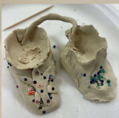
Ms. Staples class at Fleetwood makes mini moccasins