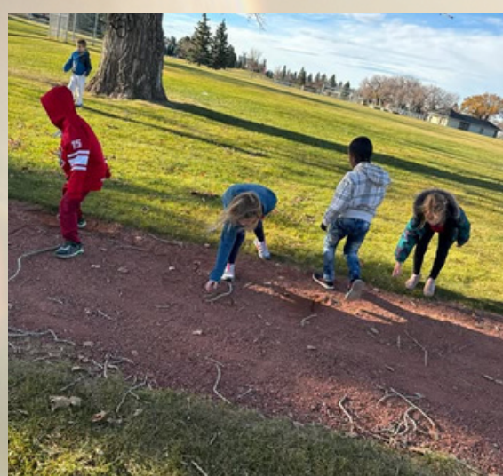
Grade 1 Learns how to have fun with nature learning about traditional Blackfoot games