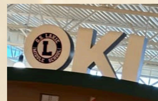
Lakie's school entrance!