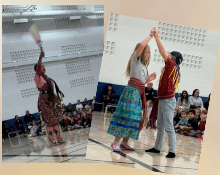
Coalbanks learns about the word for Lethbridge in Blackfoot, "Sikoohtokoki" which means Black Rock aka Coal and saw some amazing Indigenous dances