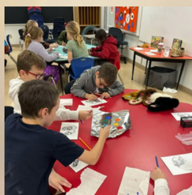
Grade 4 at Nicholas Sheran learns about moccasins and does Métis dot art