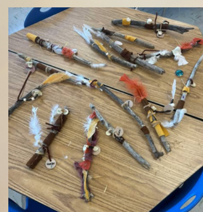
Kindergarten at Agnes Davidson learns about the sharing circle and made their own talking sticks