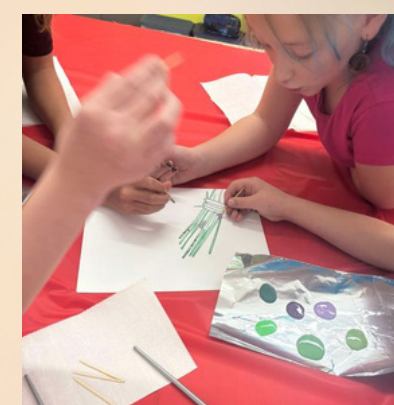
Grade 2 & 4 make collaborative art for their learning commons